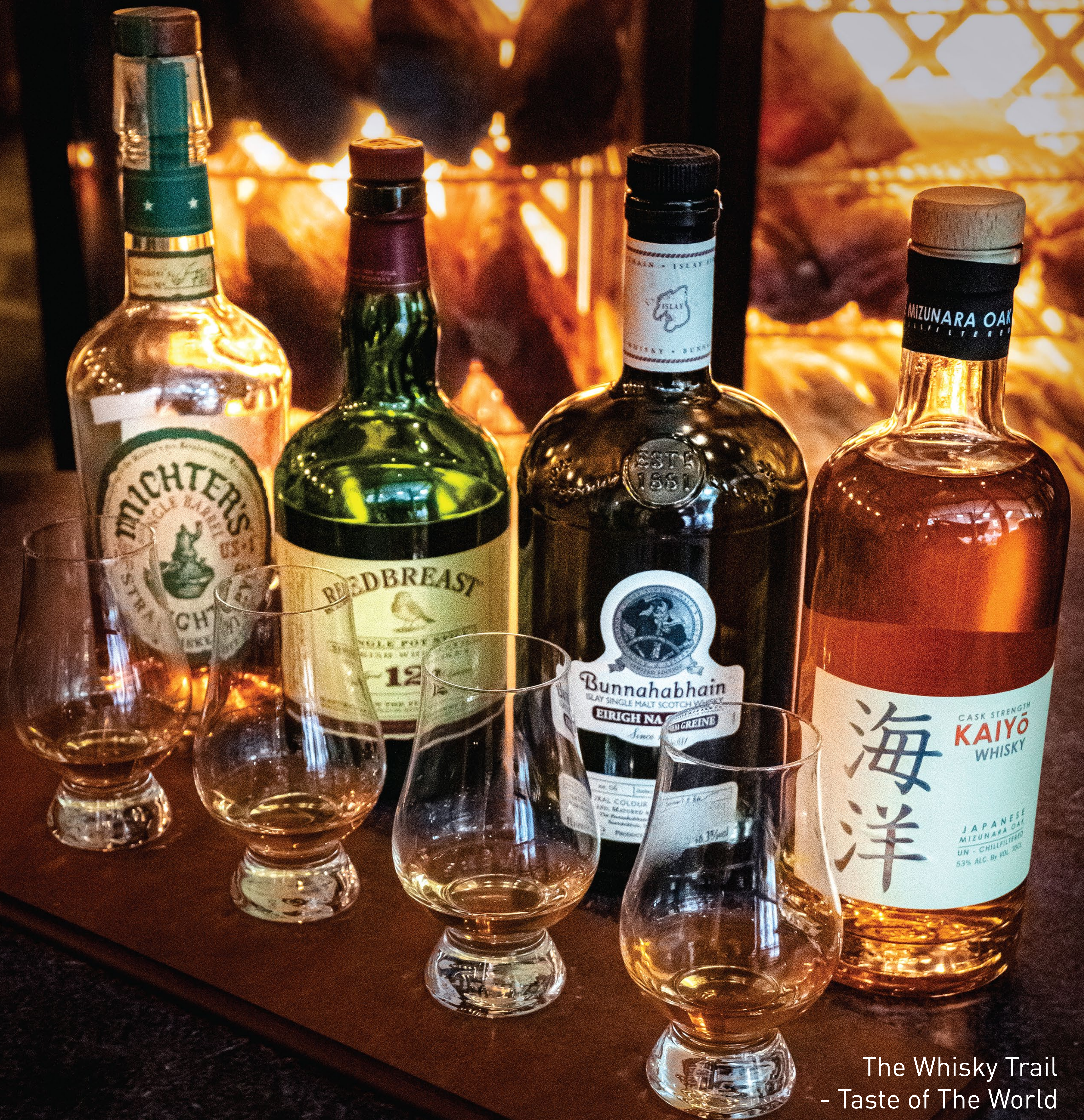
The Whisky Trail - Taste of The World