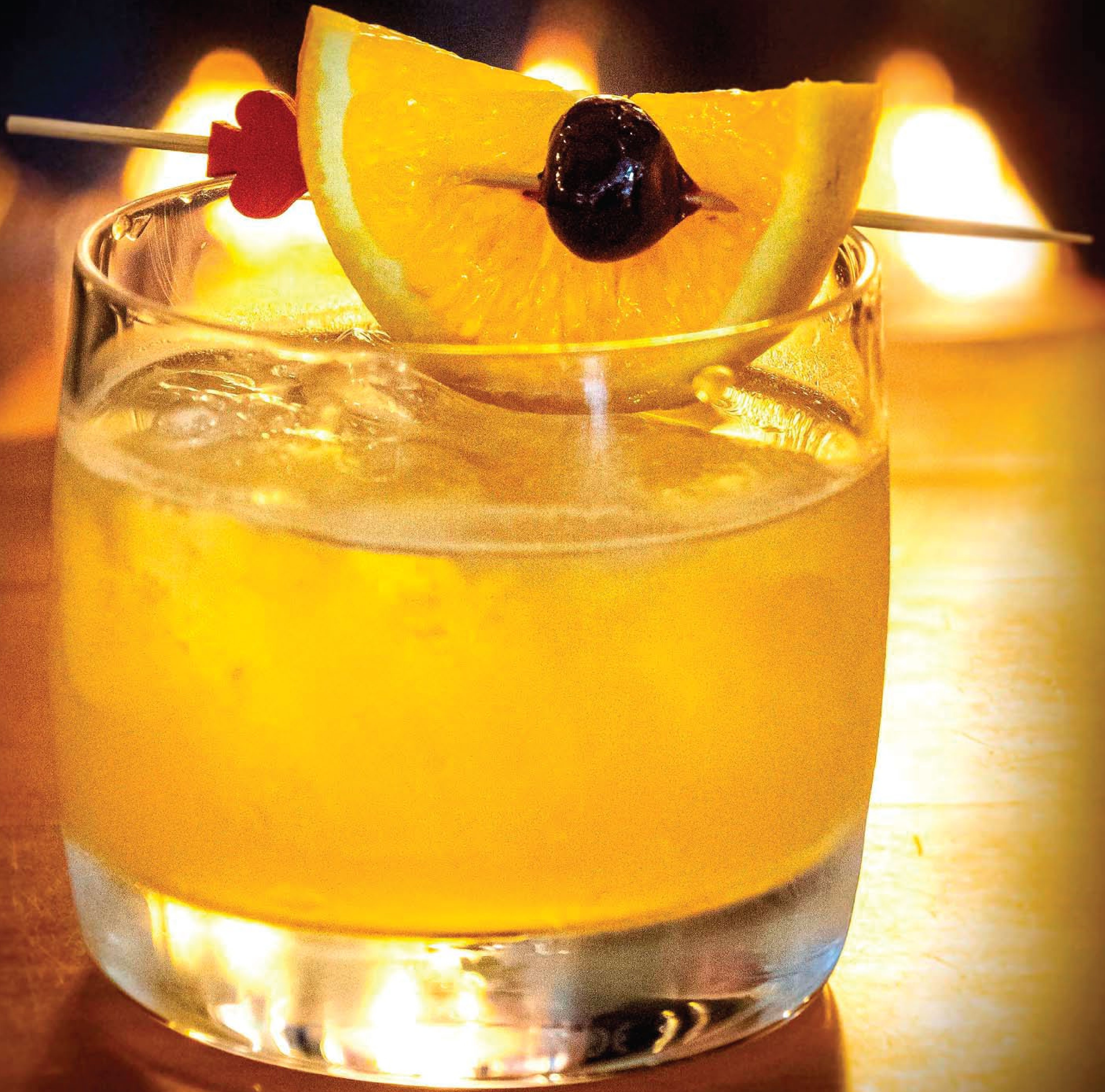
Bedrock Whiskey Sour